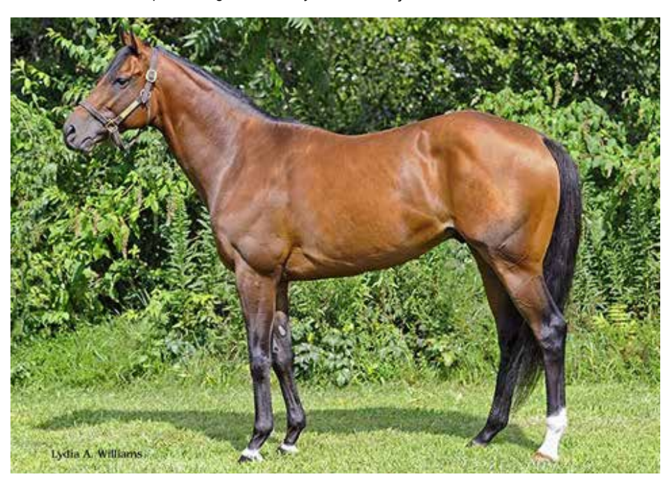
Stakes winner Winchill, a son of Tapit, stood his first season at Pointer Farm in Bernville, Pa.

a useful runner. Add to that their strategy of purchasing young juvenile fillies with excellent pedigrees, and one can be certain that Pewter Stable will continue to hail amongst the highest level of breeders in the state of Pennsylvania.